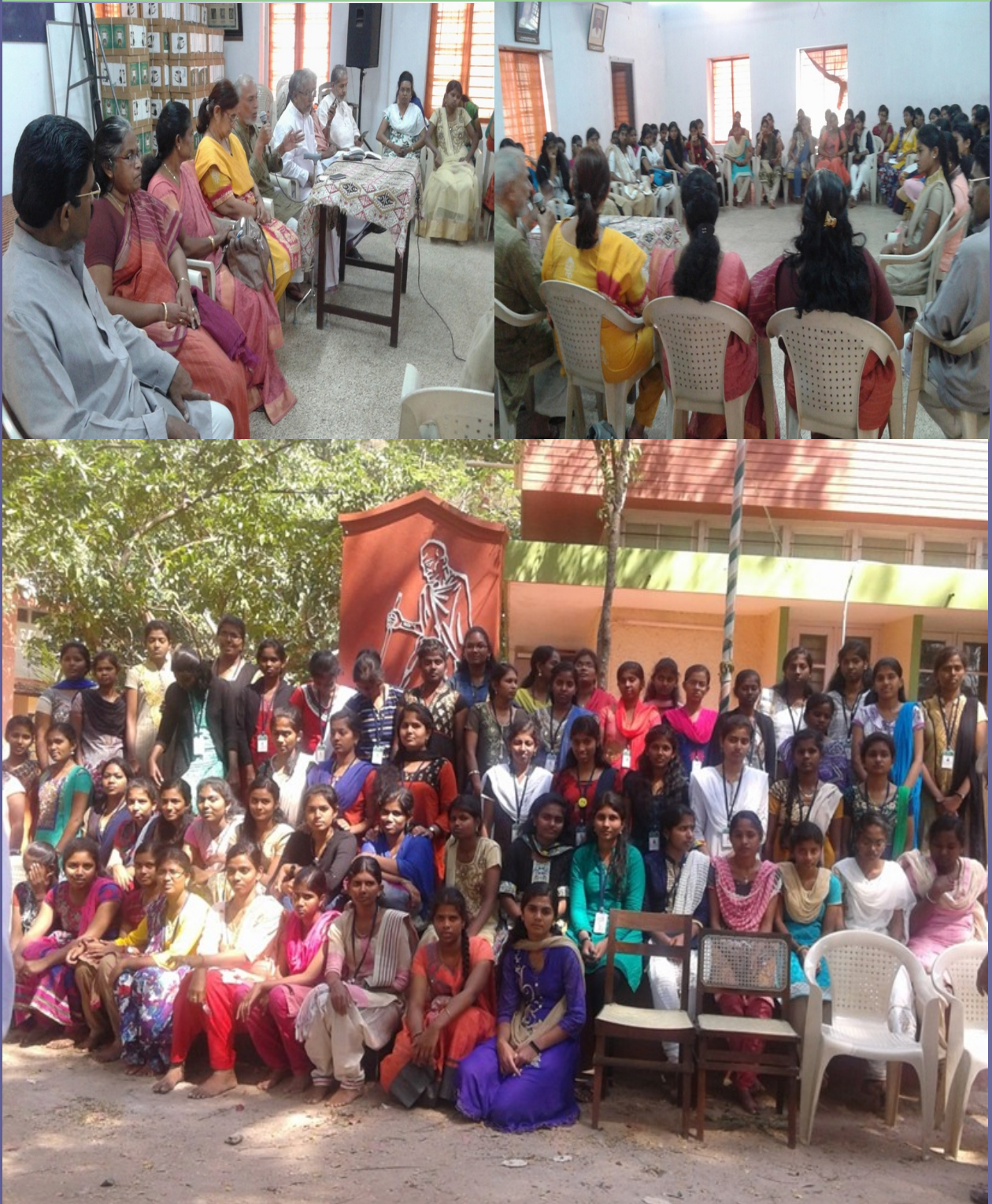
The Department of Sociology and the Centre for Gandhian Studies arranged Two Day Educational tour for 30 students of add on courses on Gandhian Thought to attend the programme at the Rengaprabhat Children's Theatre campus and Gandhi Bhavan at Trivandrum, Kerala.