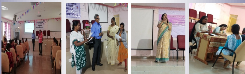
Placement Drives by Simho HR Services Pvt.Ltd.& Santham Mt.Hr.Sec.School

06.04.2019 Sona yukti Pvt. Ltd. And HireMee jointly organized a Job Fair in collaboration with 20+ reputed companies at Mangayarkarasi Group of Institutions, Madurai.