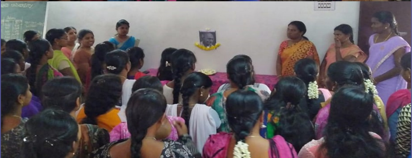
Sarvodaya Day/Martyr's Day was observed in the University's Main Campus and its Research and Extension Centres.